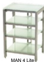
MAN 4 Lite